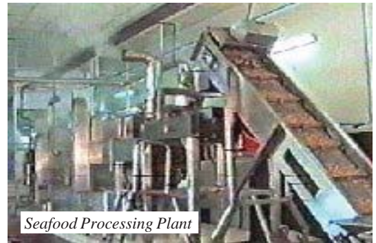
Seafood Processing Plant